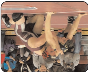
Crimson Wave News--See Page 3

46th Annual Ball - page 1 Crimson Wave News - page 3 Alumni News - page 5