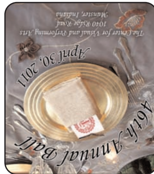
46th Annual Ball--See Page