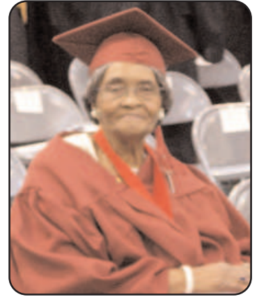
Commencement--See Page 3