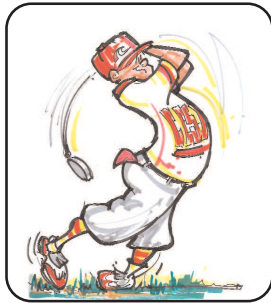
10th Annual Golf Outing-See Page 5