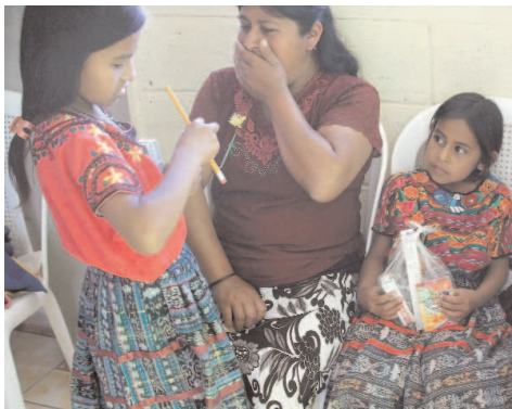
Guatemalan mother holds back tears as her daughters receive school supplies