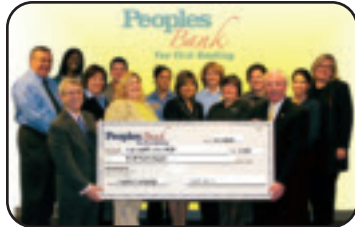
People's Bank Donates-See Page 3