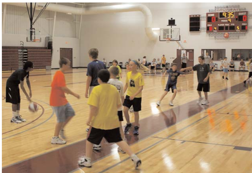
Children run drills in the new Student Activity/Community Center