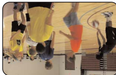
Camps for kids in New Gym--See Page 8