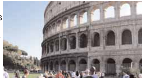
When in Rome...

The only way to appreciate the whole tour is to experience it. Words cannot describe having a ride in a gondola and weaving in and out of canals in Venice, walking in the coliseum with its elaborate history of Christian deaths, and the private audience with the Pope. It was just too wonderful to explain. If you missed out on this year's trip—never fear! The Alumni Association is planning next year's trip, which will be announced in future issues of the Update.