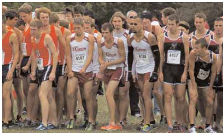
On your mark, get set, GO!