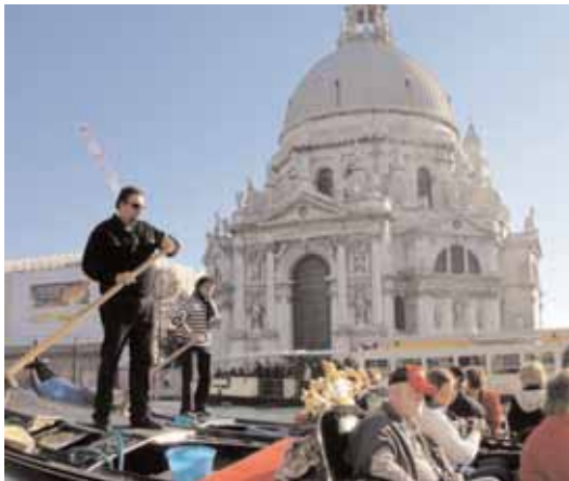
A view of Venice