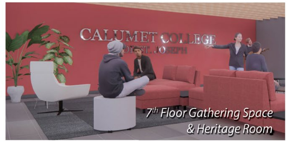
7 th Floor Gathering Space & Heritage Room